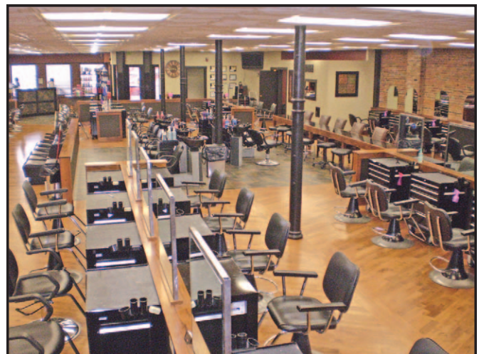
Capri offers the most comprehensive, hands-on education possible.

Capri College's reputation is the result of decades of dedication to providing the best education possible, while serving the community with quality products and services. For more information about Capri College call 563-588-2379 or 800-728-0712, or visit their Web site at www.capricollege.edu .